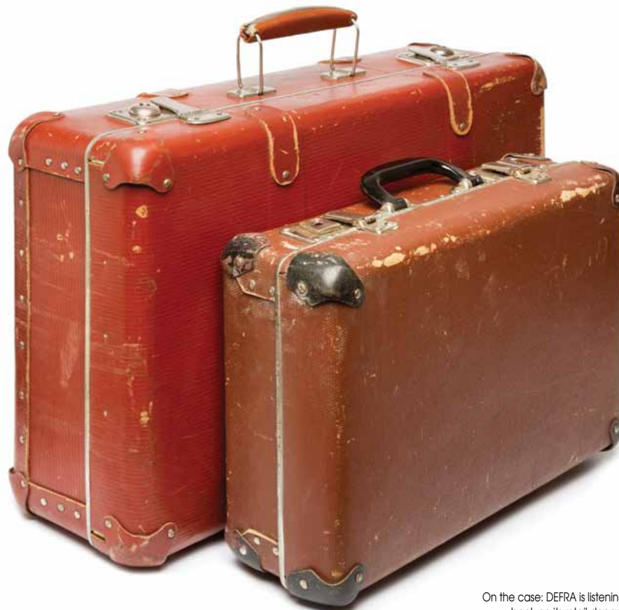
On the case: DEFRA is listening to feedback on its retail departure plans

Timetable: There was concern around the tight timetable of the exit