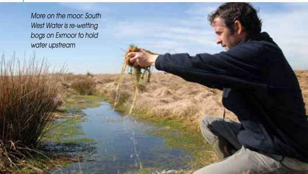
More on the moor: South West Water is re-wetting bogs on Exmoor to hold water upstream

Such catchment and land management activities show that the industry – some companies at least – are already straying out of traditional areas to explore new upstream service provision. The upstream reform agenda, be it fast or slow to take off, looks set to accelerate this diversification and create markets for new upstream services.