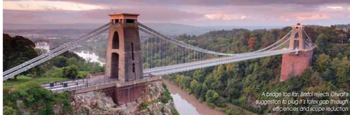
A bridge too far: Bristol rejects Ofwat's suggestion to plug its totex gap through efficiencies and scope reduction

Of the listed companies, South West Water enjoys privileged enhanced status. Moderately geared United Utilities (at c60% of net debt to RCV) is aiming to stick within its current gearing range of 55-65%, maintain its existing credit ratings (A3 with Moody's) and target dividend growth in line with RPI inflation. According to Moody's: "Given (1) the group's