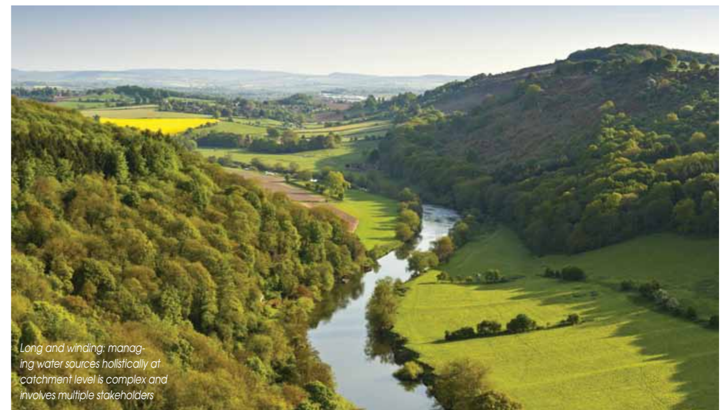
Long and winding: managing water sources holistically at catchment level is complex and involves multiple stakeholders

stream outcome for customers, the environment or both – for instance, higher water quality or the delivery of a certain quantity of water to a treatment works. The services include conventional water and wastewater services and a wide range of less developed services such as those procured from farmers by water companies to protect water quality; water resource services such as water trading and abstraction licence trading; and capacity and resilience planning involving the water and other sectors – agriculture, energy, business and the environment. (For further >