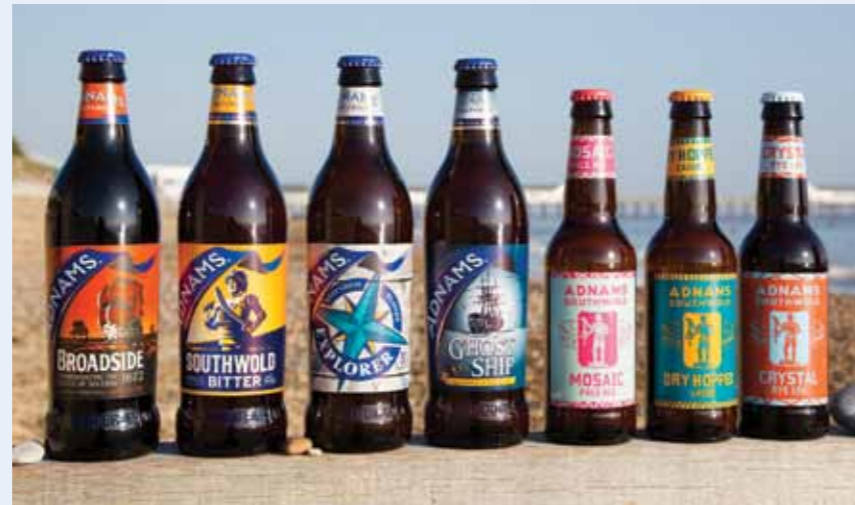
Beside the seaside: Adnams has explored desalination to secure its water supply

Carter elaborates: “We don’t always go for the cheapest when we are choosing who to work with. We want good advice and good service. We do like working with local businesses.” He provides a couple of examples of recent switches away